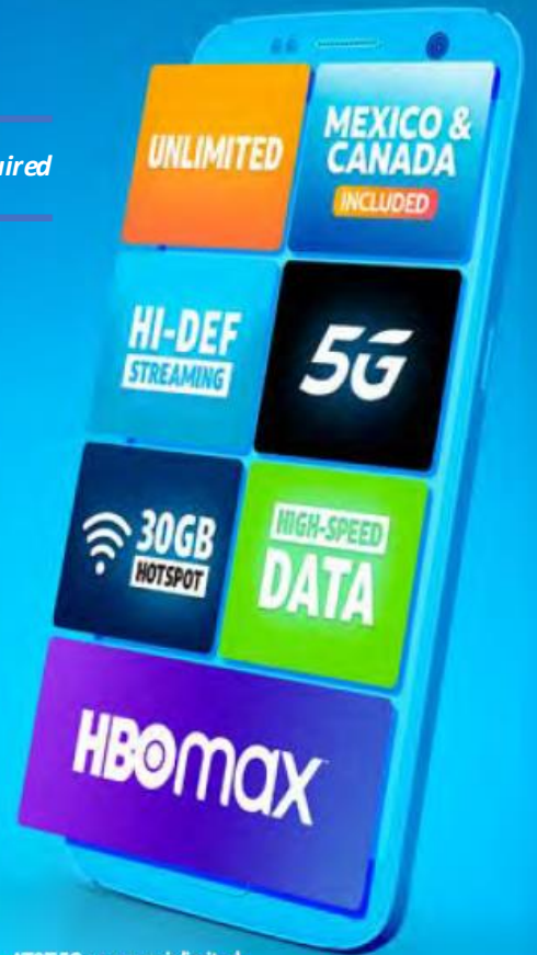
AT&T 5G coverage is limited. For coverage details, visit att.com/5G for you.

Get unlimited data, HD streaming, 30GB of mobile hotspot data, plus HBO Max TM included